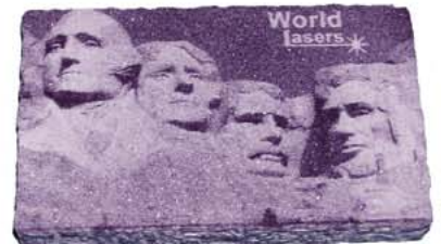
* Engraved Photograph (Marble)