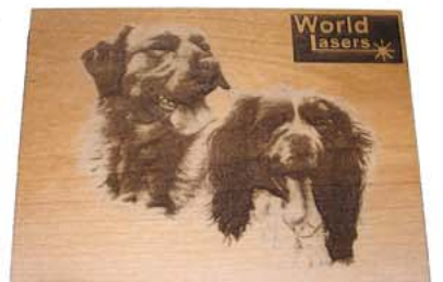
* Mixed Vector and Raster (Wood)